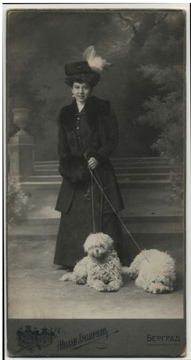
Studio portrait of a lady with dogs