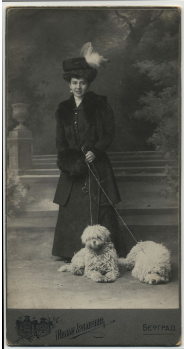
Studio portrait of a lady with dogs