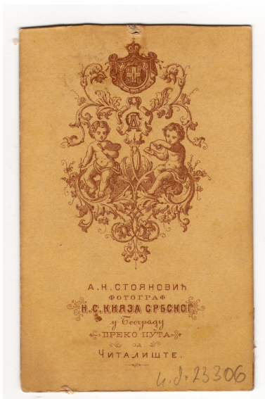
Studio portrait of three young men