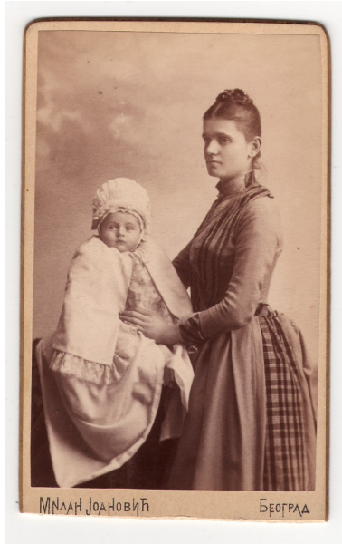
Studio portrait of a woman and a baby