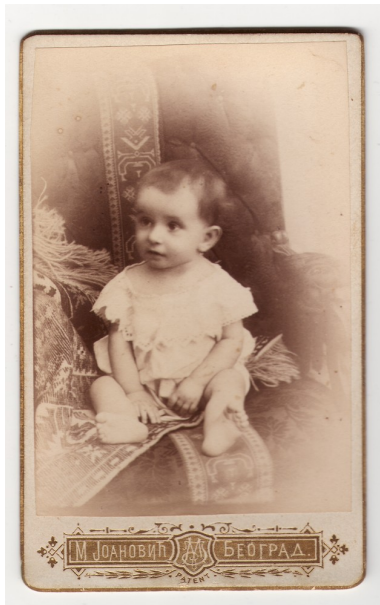
Studio portrait of an infant