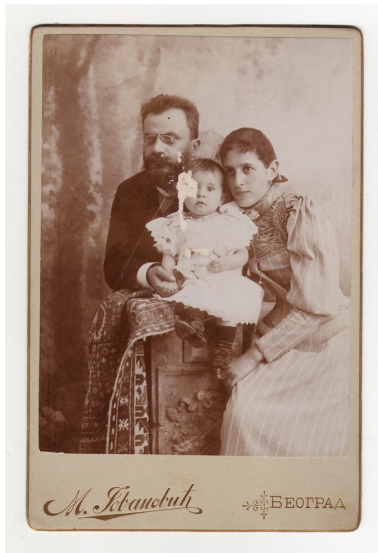
Studio portrait of a family