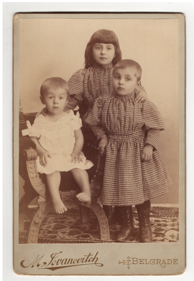
Studio portrait of three children