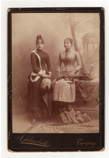
Studio portrait of two ladies