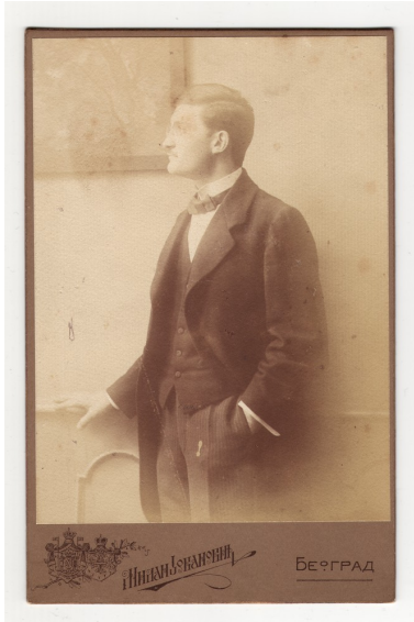
Studio portrait of Rade