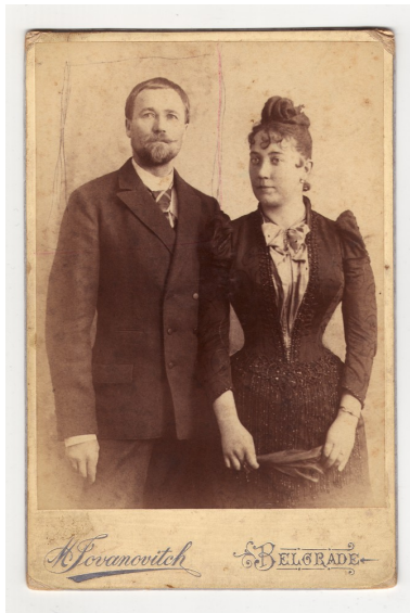
Studio portrait of a couple