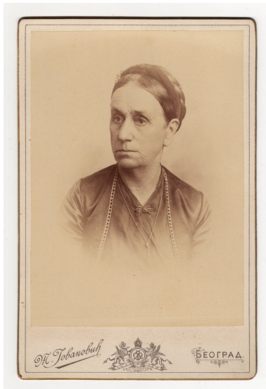
Vignetted portrait of a woman in traditional Serbian town attire