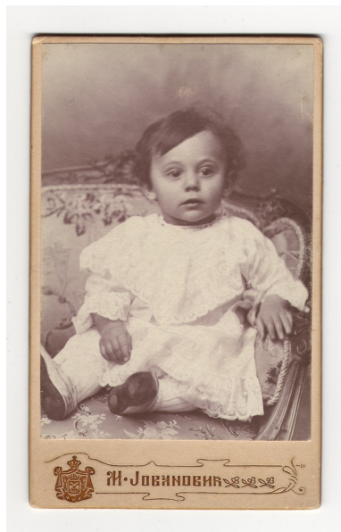
Studio portrait of a young child