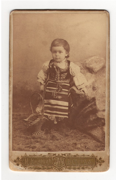
Studio portrait of Sojka Garašanin