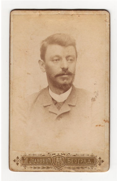
Vignetted portrait of a man in town attire