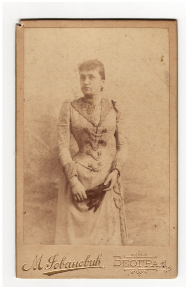
Studio portrait of a young woman