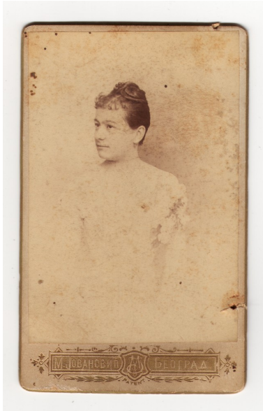
Studio portrait of a young woman