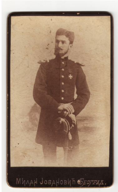
Studio portrait of a man in uniform