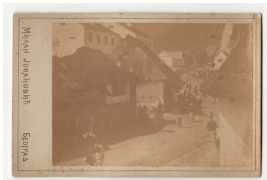
Outdoor photograph of Višegrad