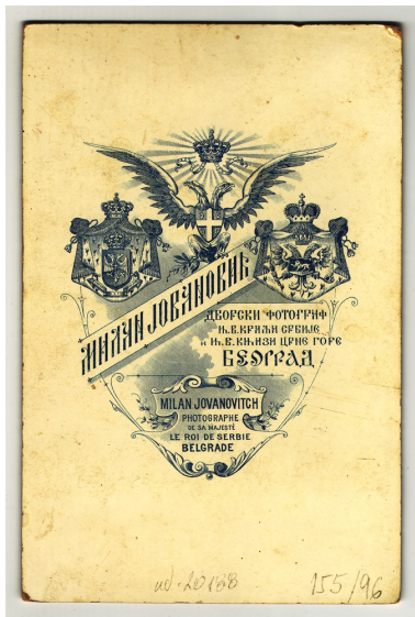
Monument commemorating the Kosovo Heroes