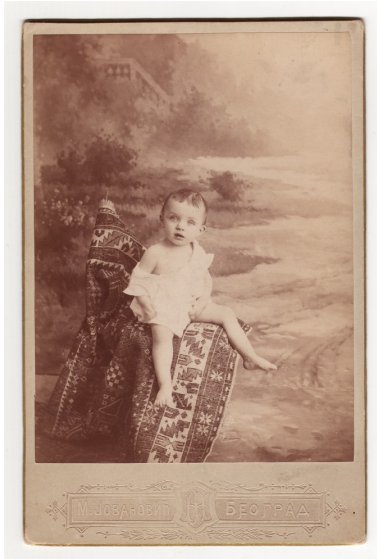
Studio portrait of Dušan Jovanović