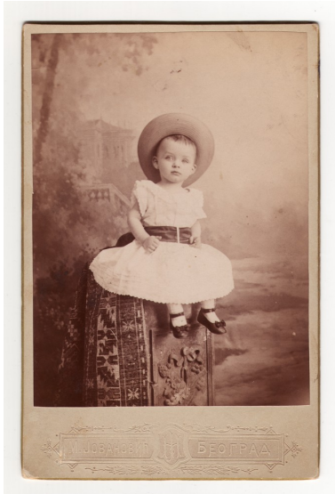
Studio portrait of Dušan Jovanović