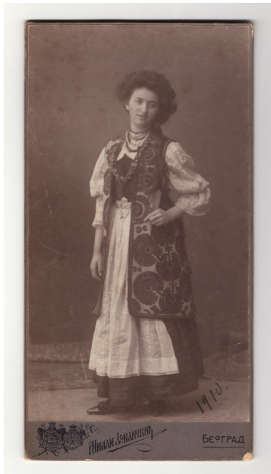
Studio portrait of a young woman wearing a 'zubun'

Object: Studio portrait of a young woman wearing a 'zubun' Description: Full-length shot of an unmarried woman dressed in traditional Serbian town attire, wearing a 'zubun' (long, formal, embroidered sleeveless vest). Comment: Women did not cover their hair until they got married. Date: Not before 1900, Not after 1902 Location: Belgrade Country: Serbia