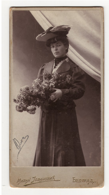
Studio portrait of Olga