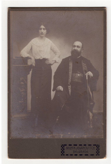
Studio portrait of a priest and his daughter