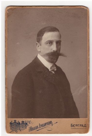
Studio portrait of a moustached man