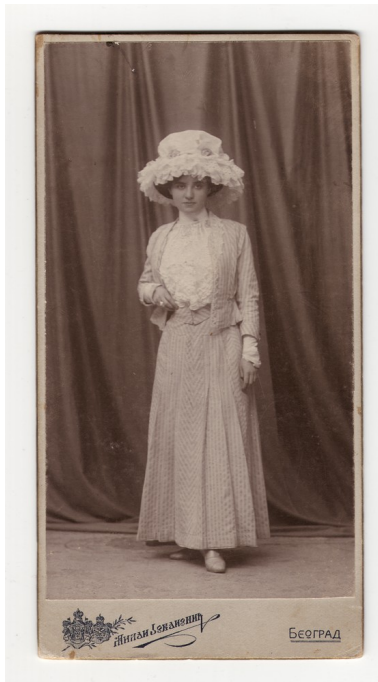
Studio portrait of a young lady with a white hat