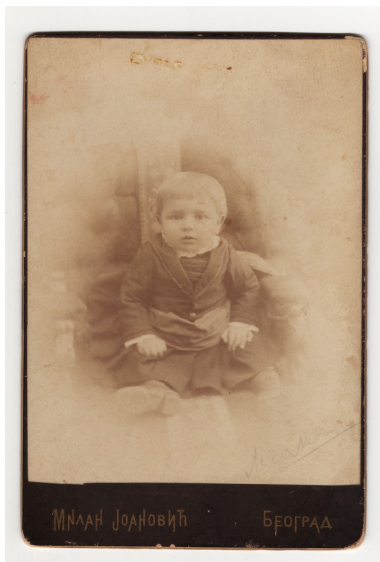
Studio portrait of Milivoj Predić