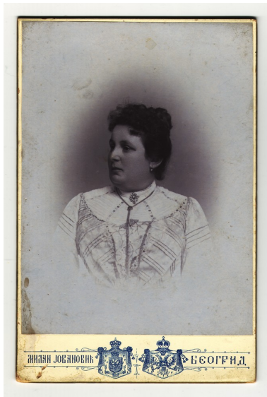
Vignetted head of Jelena Nikolić