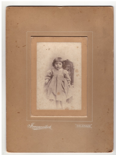
Studio portrait of Jovica