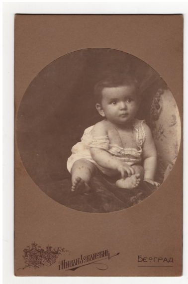
Studio portrait of a baby in an oval frame