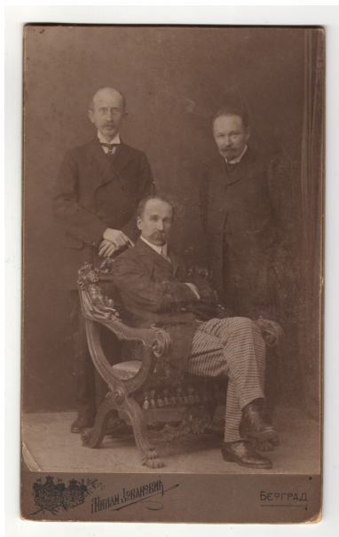
Group portrait of Professor Milenko Vesnić, Professor Slobodan Jovanović and another man