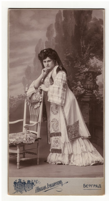
Studio portrait of Zora Horstig