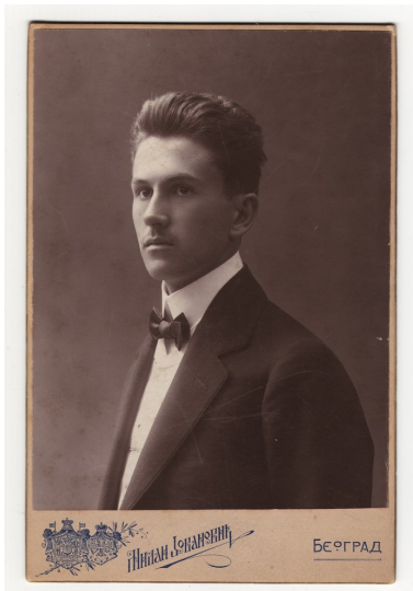
Studio portrait of Božidar "Boco" Vlajić