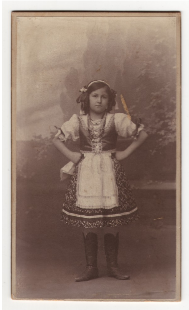
Girl in Hungarian national dress