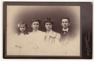
Studio portrait of a young teacher and her students