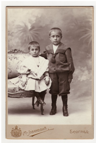
Studio portrait of children