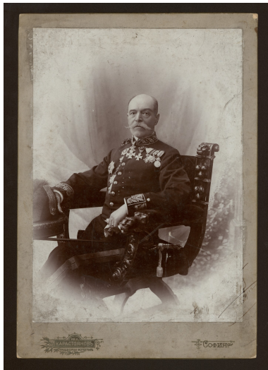
Studio portrait of a man in an uniform