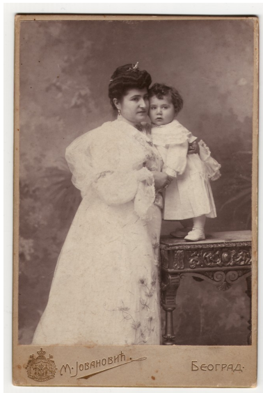
Studio portrait of a woman and a child