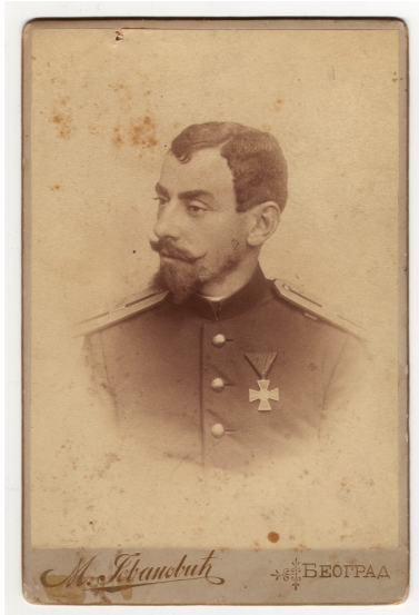
Studio portrait of a man in uniform