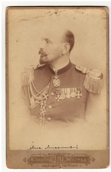
Studio portrait of Major Mih. Mihailović