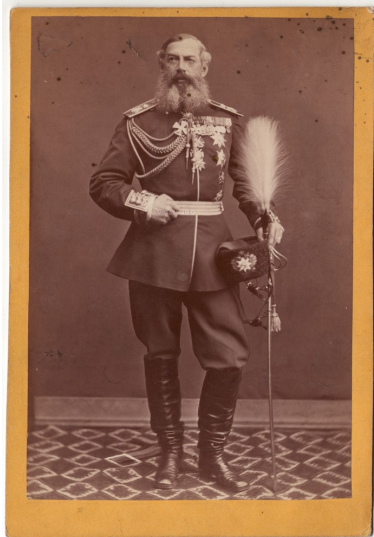
Prince Alexandr Mikhailovich Dondukov-Korsakov