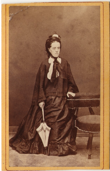
Young lady in a dark dress