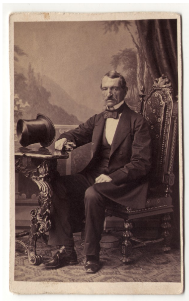
Ilija Garašanin, politician and statesman