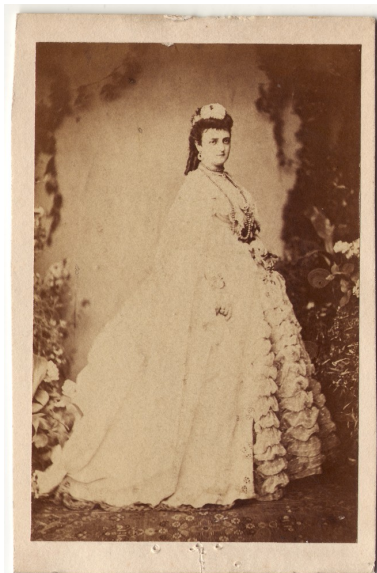
Princess Julija Obrenović