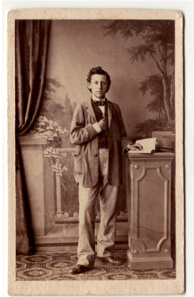
Konstantin A. Jovanović, architect