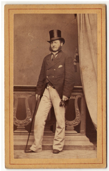
Konstantin A. Jovanović, architect