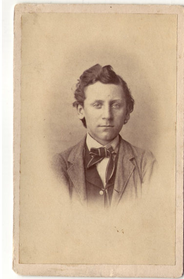
Konstantin A. Jovanović, architect