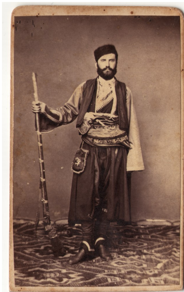
Portrait of a man dressed in folk attire