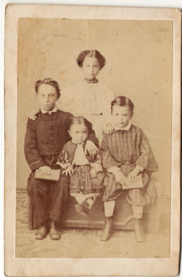
Group portrait of four children