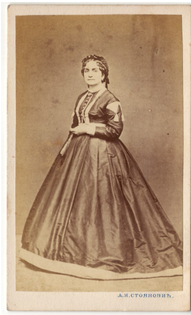
Studio portrait of a woman in a dark dress