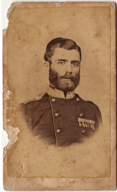
Mihailo Obrenović III, Prince of Serbia